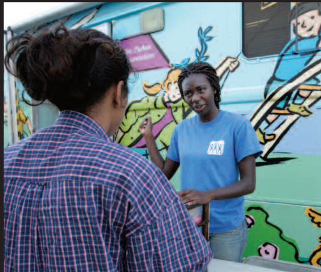
Family Health Centers of San Diego Teen Mobile Clinic