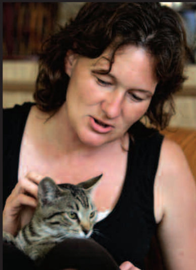
P.A.W.S. San Diego County