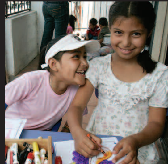
Eunime Por-Tijuana, A.C.